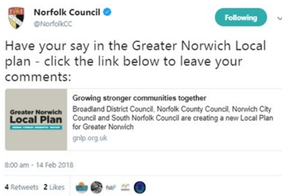
Norfolk County Council Twitter and feedback