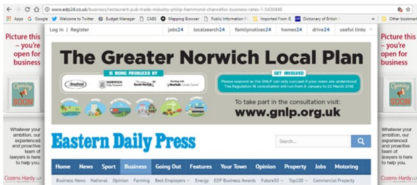
Adverts on the EDP website and in the newspaper