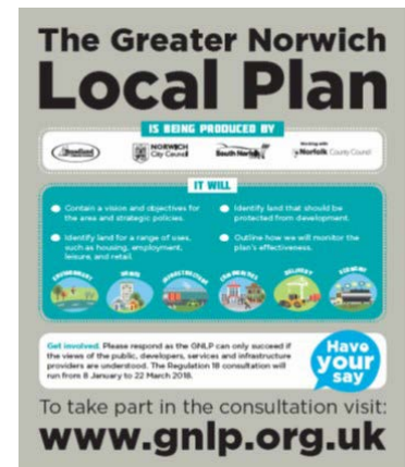
Widely distributed posters/flyers