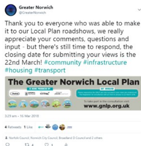
Early advertising on Greater Norwich Twitter