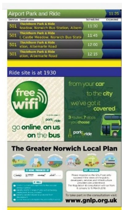
Advertising at Park and Ride sites