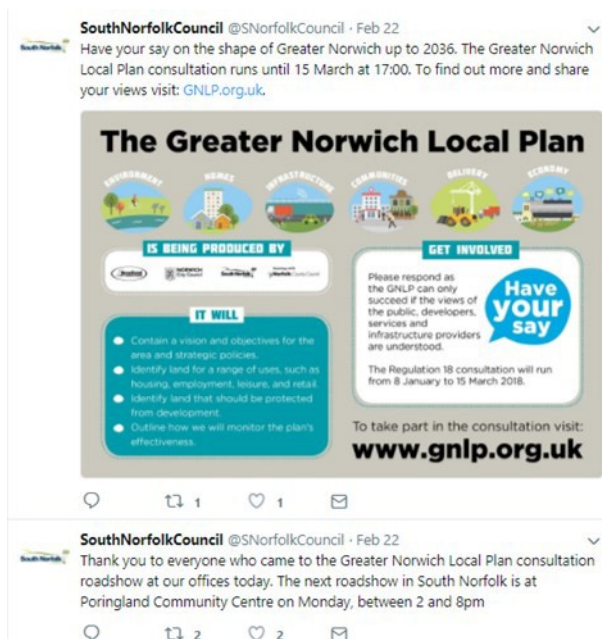
South Norfolk Twitter updates