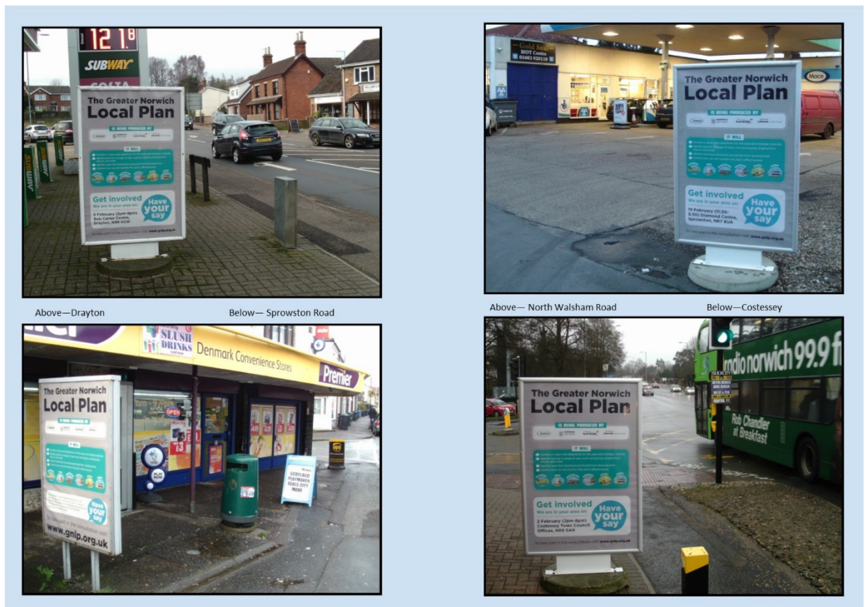
Figure 3 Examples of the GNLP 'Growth Options & Site Proposals' consultation poster campaign