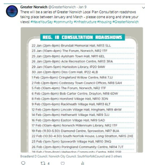
Greater Norwich website and Twitter advertising roadshows