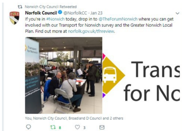
Norfolk County Council updates on Transport for Norwich and the GNL