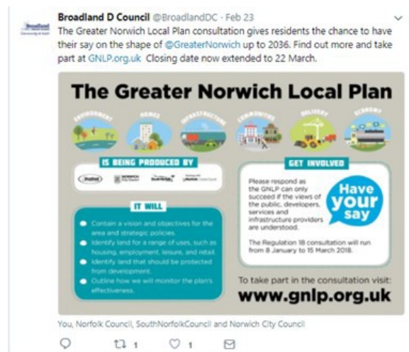
Broadland District Council Twitter, promoting consultation