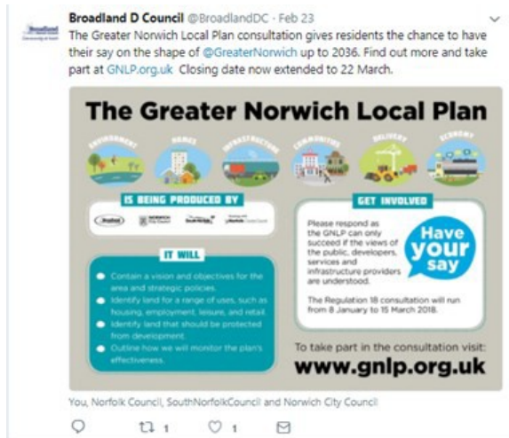
Extension to consultation widely announced