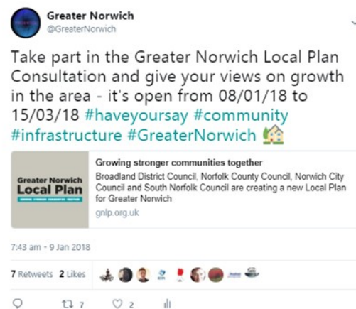
Greater Norwich Twitter feedback from events