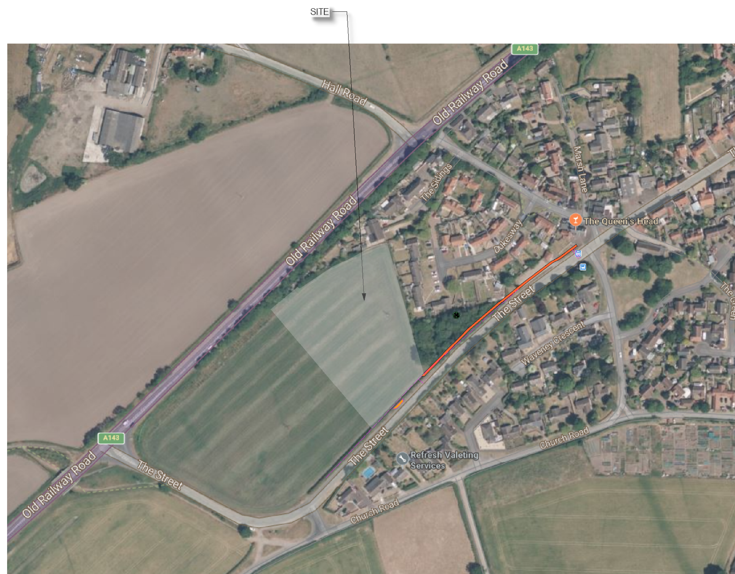
3 Aerial Plan Scale: nts