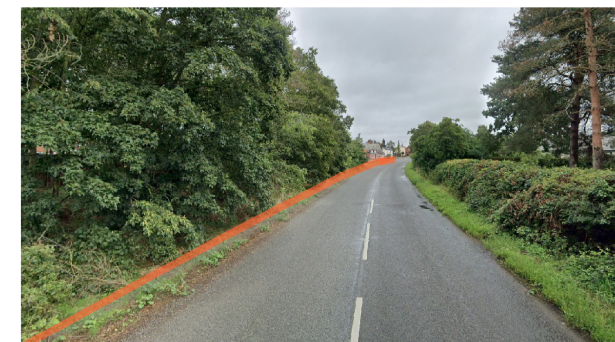
3. 2m roadside footpath. vegetation trimmed.