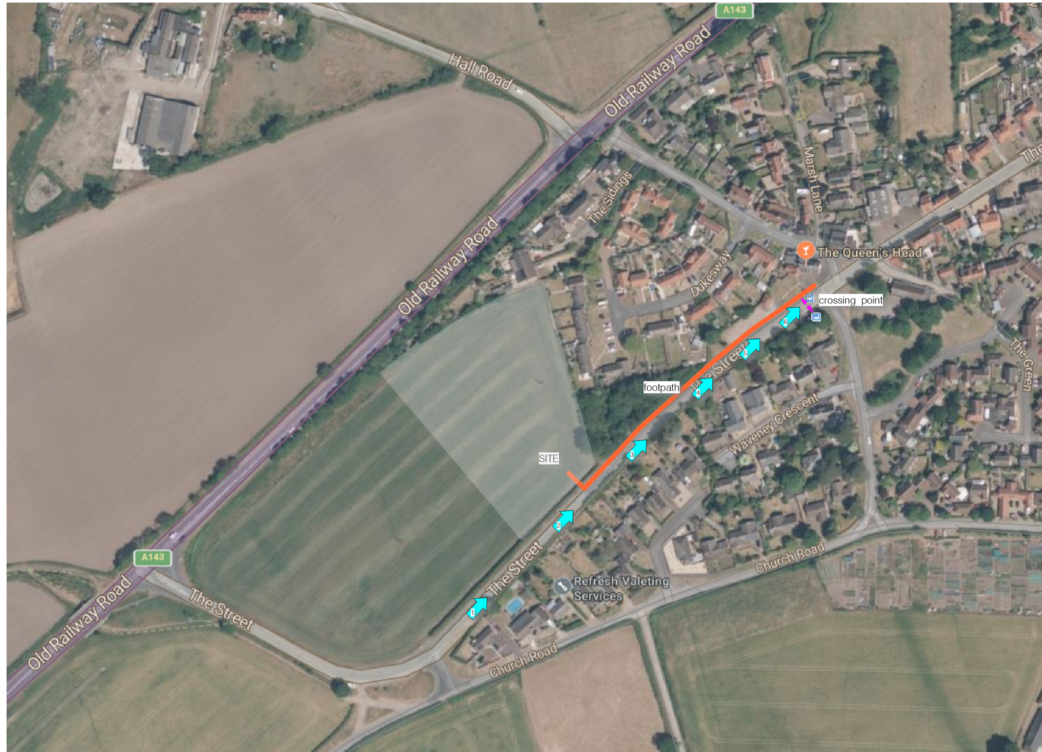
New Roadside Footpath To Village