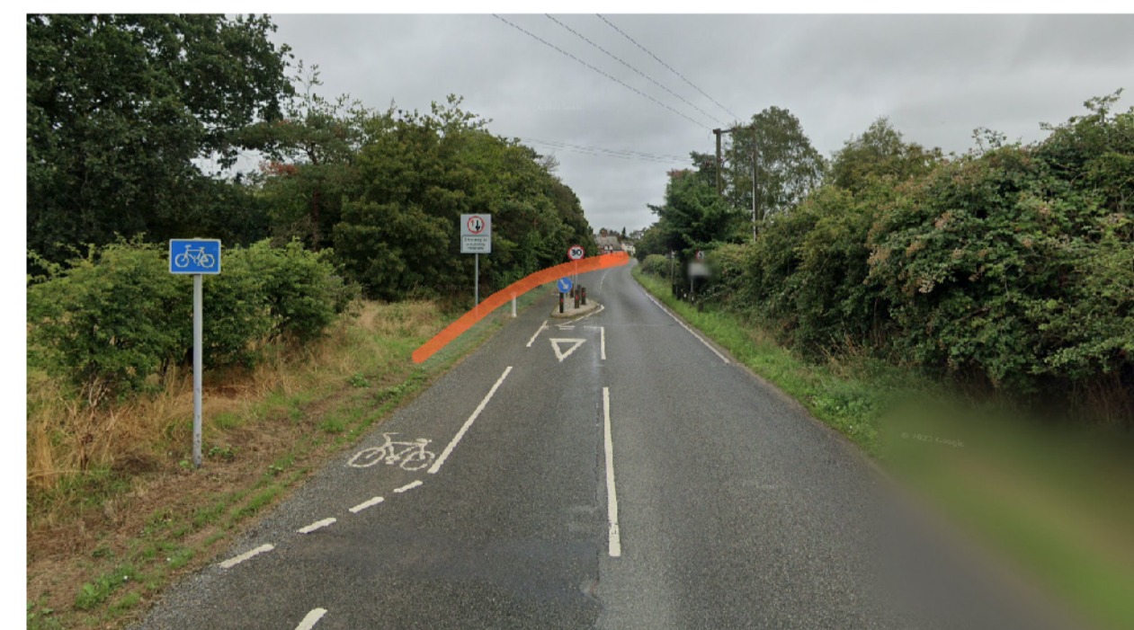
2. New 2m roadside footpath linking site with village services