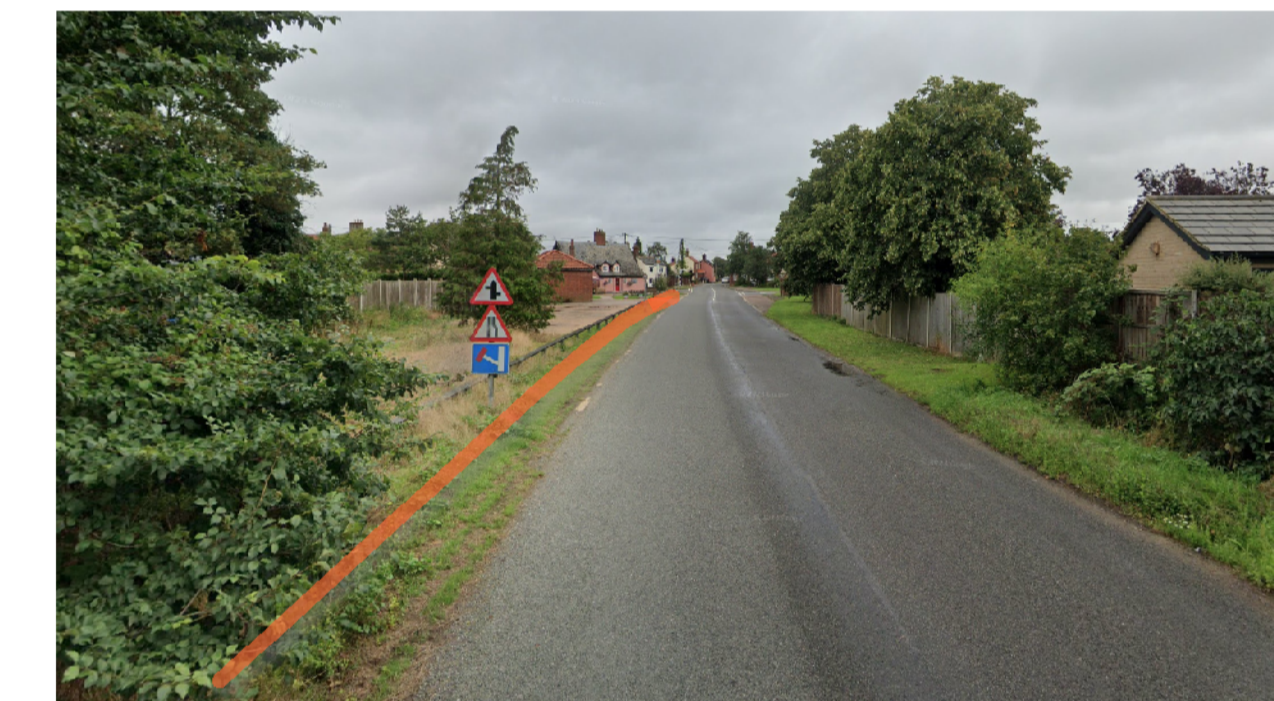
4. Footpath continues to bus stops and Pub