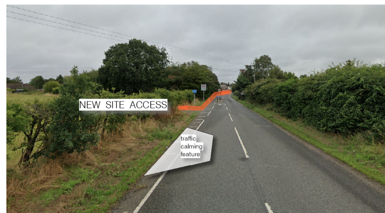
1. New site access. Repositioned traffic calming feature and 30mph signage.