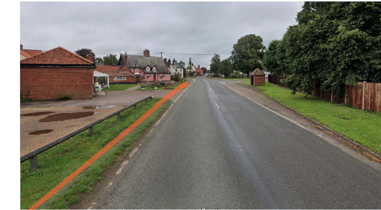
5. Access crossings over footpath